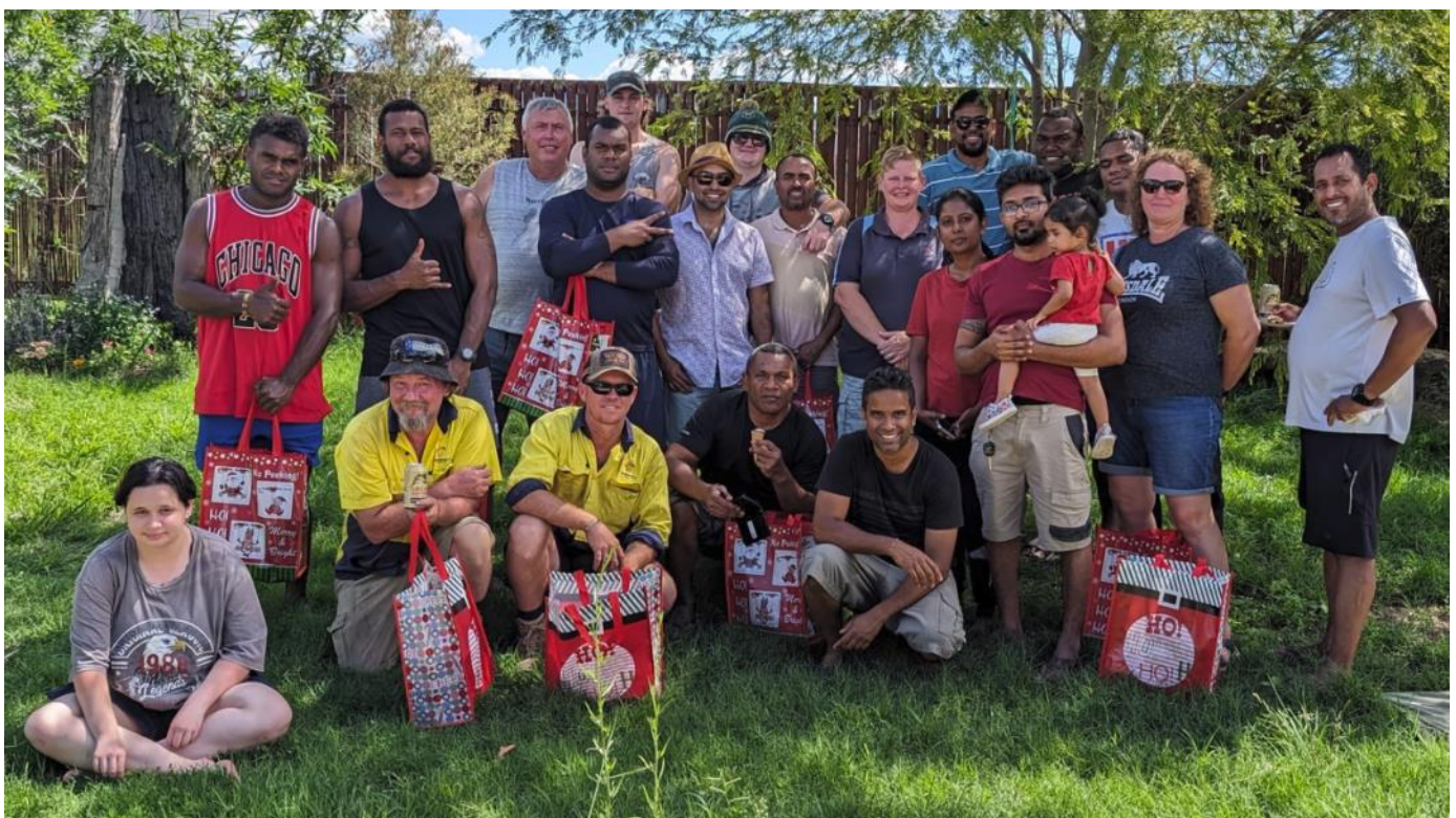
Below: the extended Hendon crew celebrating Christmas