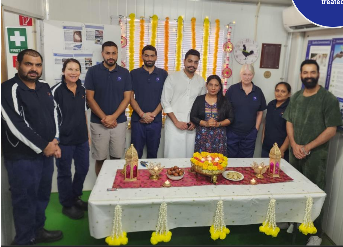
Above: the team at Back Plains celebrating Diwali

We treat each other the way we would like to be treated